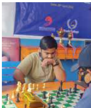
BWIC CHESS FEST