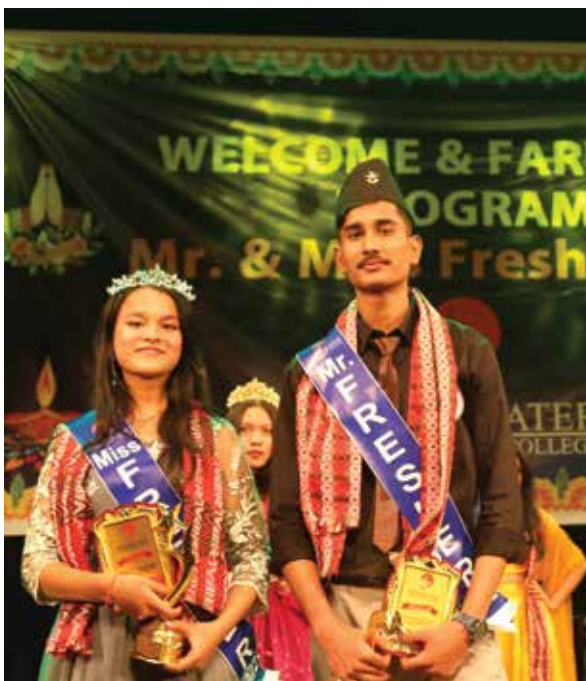
Winners of Mr. & Miss Fresher 2023

The ones who inspire us are our greatest teachers. Our PDP inspires you to be a good and creative citizen. Career counseling makes inroad in the job market after you graduate.