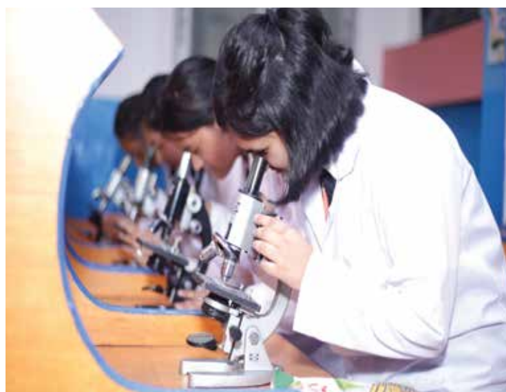
STUDENTS USING MICROSCOPE IN CHEMISTRY LAB