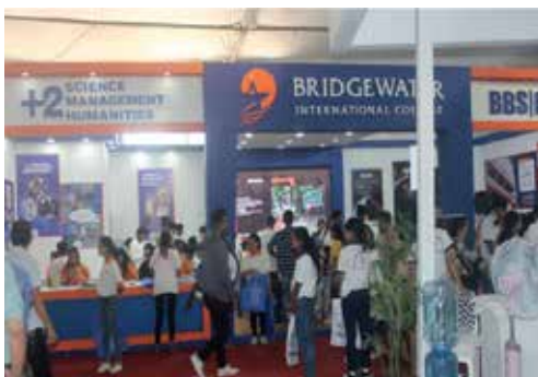
HISSAN EDU FAIR