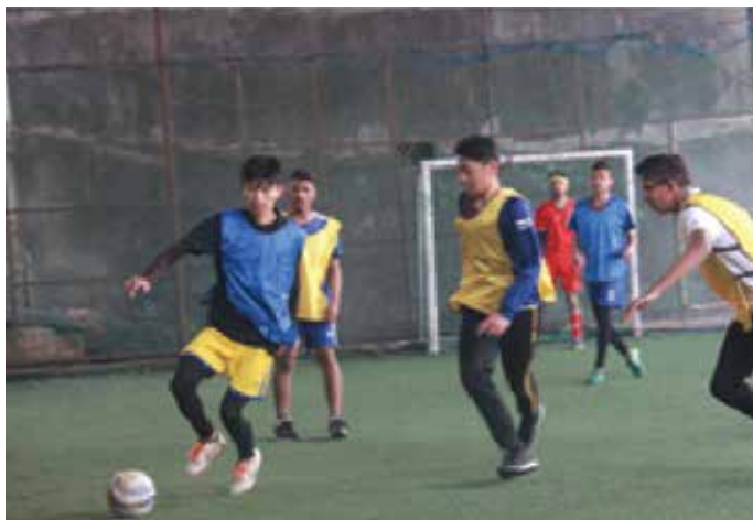
Sports Club (Basketball, Football, Table Tennis, Cricket, badminton, etc.)