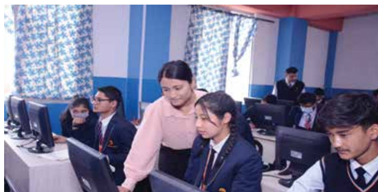
STUDENTS IN COMPUTER LAB