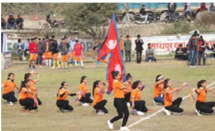
Kala & Sangit Club