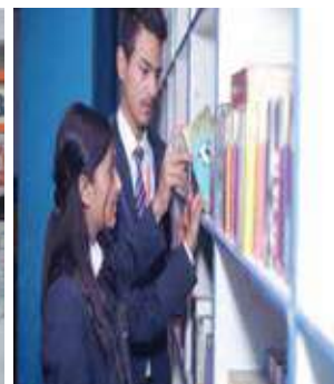
STUDENTS IN LIBRARY