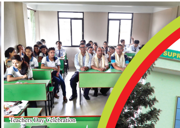
Teachers Day Celebration