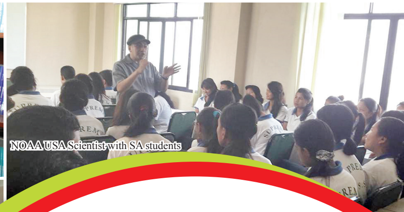
NOAA USA Scientist with SA students