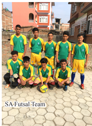
SA Futsal Team