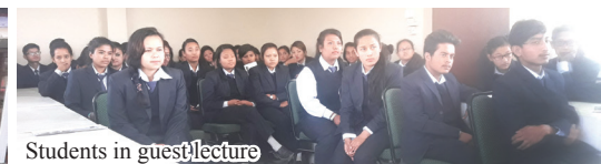
Students in guest lecture