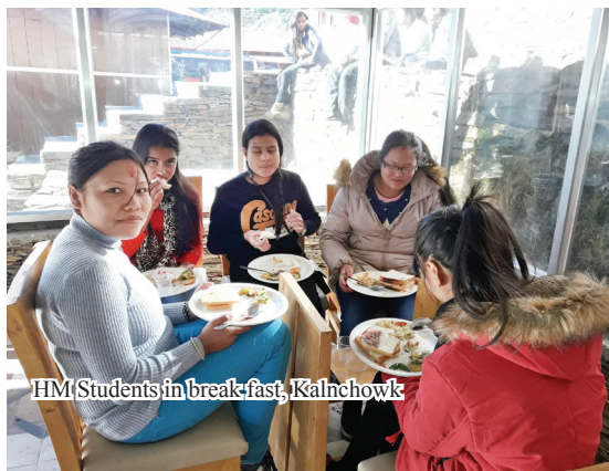
HM Students in break-fast, Kalinchowk