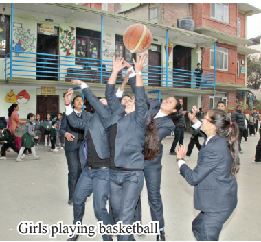
Girls playing basketball