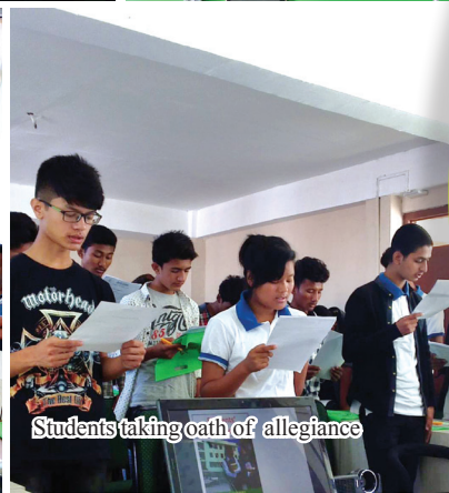
Students taking oath of allegiance