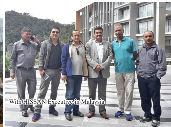
With HISSAN Executive in Malaysia