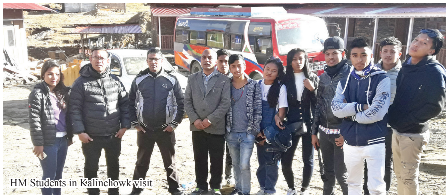
HM Students in Kalinchowk visit